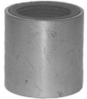
Pictured Model T-578